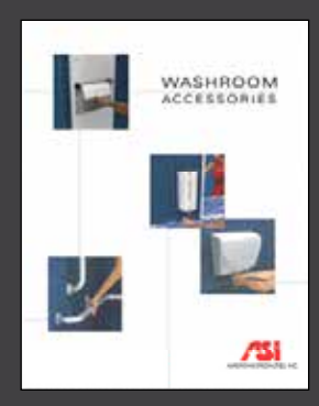
americanspecialties.com for our complete line of washroom accessories

American Specialties, Inc., Global Partitions, Accurate Partitions Corp. and ASI Storage Solutions are all part of the ASI Group of companies.